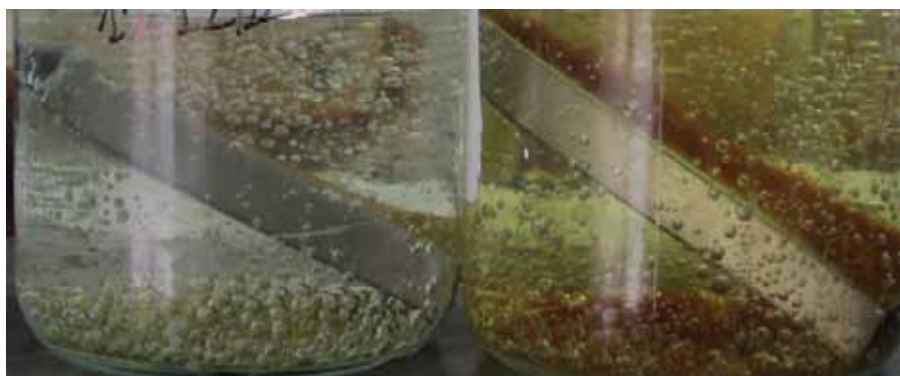
Photos of SurfaGuard Metals treated and no treated stainless steel immersed in salt water with hydrogen peroxide

At NanoPhos, we take advantage of the unique properties of nanotechnology and invent clever materials that solve every day problems. By harnessing nanotechnology, we seek to create a more comfortable, safe and trouble-free living environment. We transfer innovations out of our lab and into the hands of consumers. Our vision is clear: “Tune the nanoworld to serve the macroworld” – in simple terms we make nanoparticles solve common problems. NanoPhos was recognized in January 2008 by Bill Gates as one of the most innovative companies and also received the 1 st prize for innovation at the prestigious 100% Detail Show in London. NanoPhos is a rapidly growing company that is actively expanding its distribution network. Currently, the company is present in the UK, Norway, Sweden, Denmark, Portugal, Spain, France, Italy, Greece, Cyprus, Egypt, Sudan, Saudi Arabia, Bahrain, UAE, Qatar, Oman, Iran, India, New Zealand, China, Japan, Mexico, Guatemala, Thailand, Malaysia and Singapore.